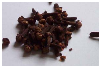
Clove oil has been used for hundreds of years for oral health.